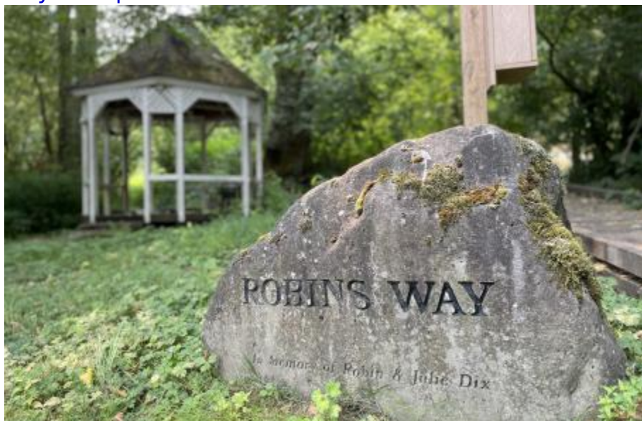
Robins Way Trail