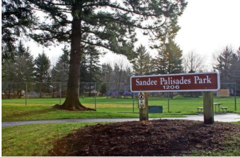
Santee Palisades Park