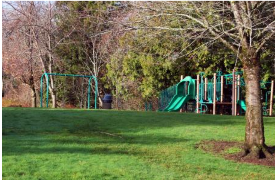
Helen Althaus Park