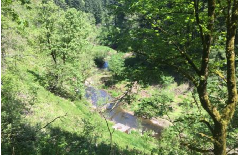
Beaver Creek Greenway