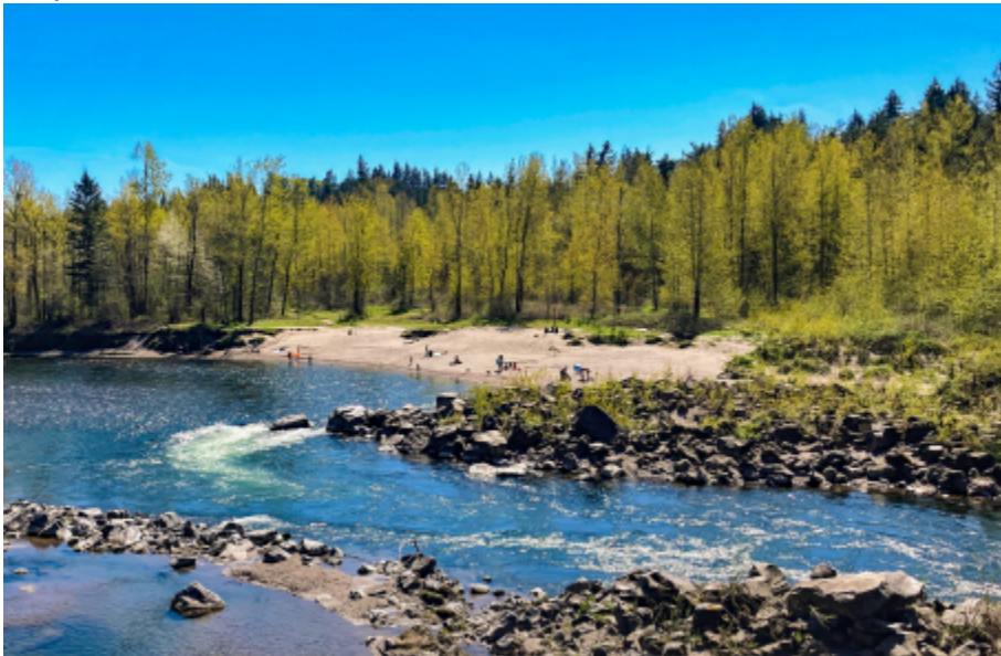
Glenn Otto Community Park