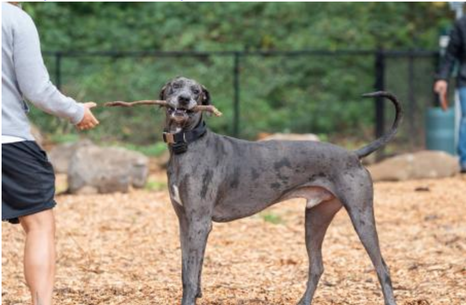
Troutdale Dog Park