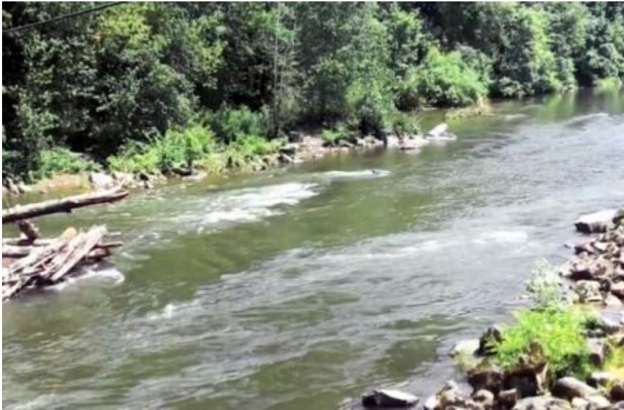
Sandy River Greenway