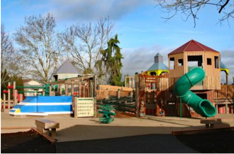
Columbia Park/Imagination Station