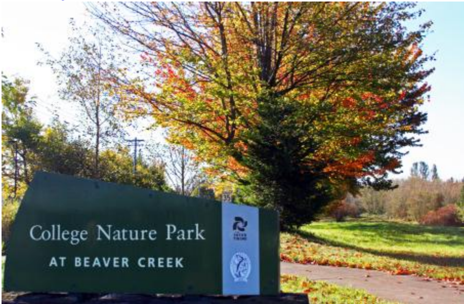
College Nature Park