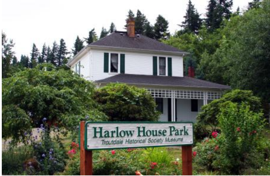
Harlow House Park