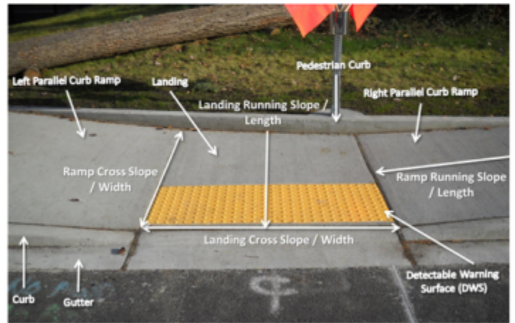
Parallel Curb Ramp